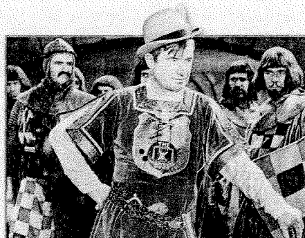
Mark Twain was one of the greatest humor writers in American literature. In A Connecticut Yankee , his main character goes back in time to the era of knights in armor.